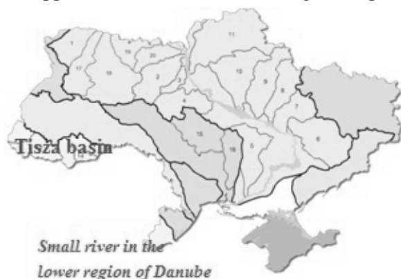
Figure 1. Ukrainian part of Danube basin

In accordance with the provisions and objectives of the EU Floods Directive (2007/60/EU) for the floods of rare probability of occurrence (once in 100, 50 or 200 years) need to perform: preliminary flood risk assessment (Article 4,5); the preparation of maps and flood risk threats (Article 6), and the approval of the flood risk management plans (Article 7).